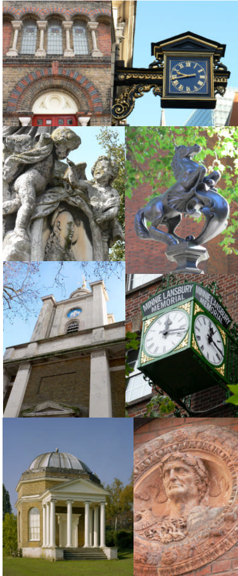
A selection of Restoration Schemes sponsored by the Heritage of London Trust From Top: The Space, Isle of Dogs; Clock, St Mary at Hill, City; Soyer Monument, Kensal Green Cemetery; Hippocampus, Mount Street Gardens Fountain, Westminster; Minnie Lansbury Memorial Clock, Bow; St John on Bethnal Green; Garrick's Temple, Hampton; Roundel of Roman Emperor, Hampton Court Palace.