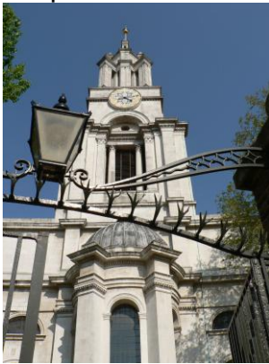
St Anne, Limehouse – one of Hawksmoor’s great masterpieces, will be open for Ride & Stride

This year the London Ride and Stride will take place on Saturday, 23 rd July. We will be focussing on four main areas within the Dioceses of London and Southwark – Westminster, Harrow, South-East London and Tower Hamlets & Hackney. A wealth of history and artworks wait to be discovered – like St Lawrence Little Stanmore, rebuilt under the patronage of James Brydges, Duke of Chandos with interior wood carving attributed to Grinling Gibbons, or St Anne Limehouse, one of Hawksmoor’s masterpieces. There will also be a number of London’s Victorian cemeteries open, including Nunhead Cemetery, offering elegant avenues of trees and exquisite examples of stone sculpture to explore.