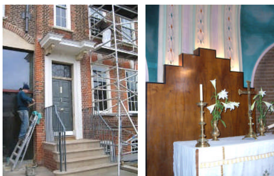
Left: Newly restored entrance and façade at 810 High Road, Tottenham; right: St Patrick's Barking, Reredos & Altar. St Patrick's has recently been listed Grade II, a great achievement!

Tottenham, Haringey (façade); Gloucester Gate Bridge, Camden (lamp standards); Petersham Lock-up, Richmond; St Andrew's Catford, Lewisham (organ case).